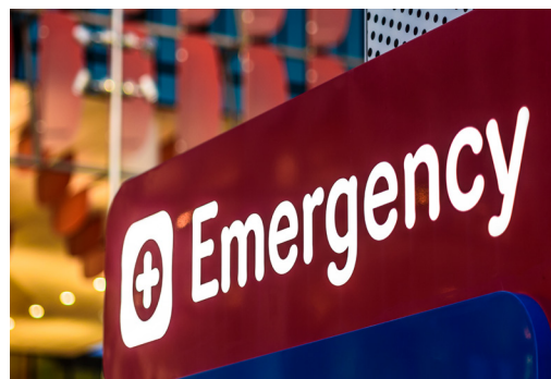
Excess limits for Urgent Care Center US Virgin Islands

General Star Indemnity Company is rated A++ by A.M. Best and AA+ by Standard & Poor's.