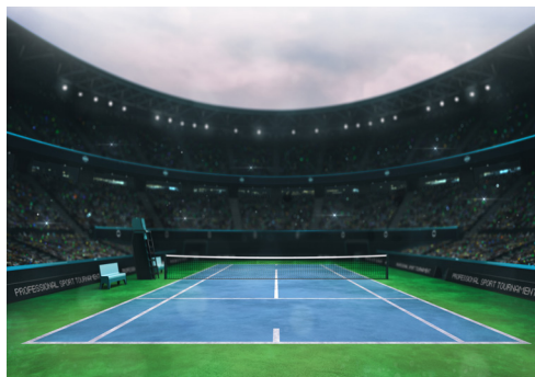
Sports Medicine Physician Coverage for U.S. Open Tennis Tournament NY and FL