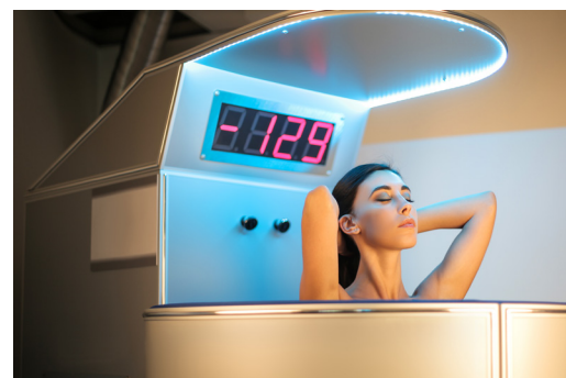
Wellness Center with Cryotherapy