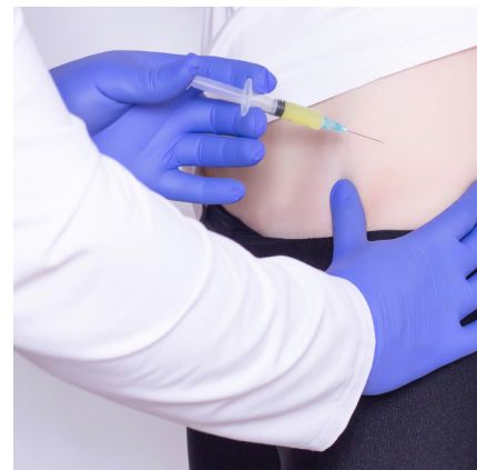
PAIN MANAGEMENT PHYSICIAN VIRGINIA

Primary Professional Liability 1M/3M – 2nd year claims made Past claims