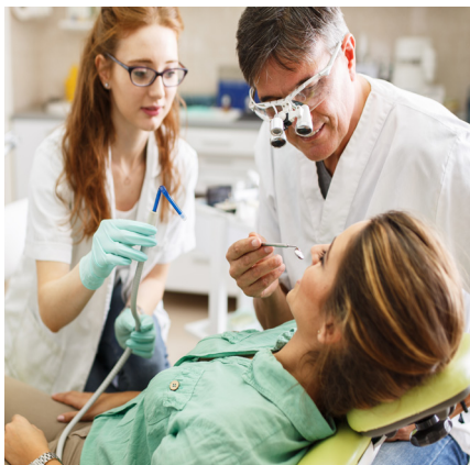
DENTAL GROUP TEXAS

Primary Professional Liability 1M/3M – RDI claims-made 1 DDS, coverage included for students