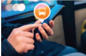
Commuter App Service

The Casualty & Medical Brokerage Division offers coverage for mobile app and internet based services, connecting customers with providers of a wide variety of goods and services.