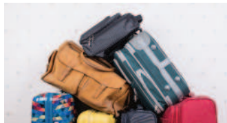
Bag Delivery Service

App based liquor delivery service $9M in delivery sales