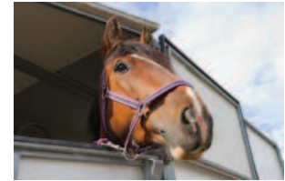
Horse Transportation Service

App based food delivery service with operations throughout the US