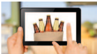
Liquor Delivery Service

App based transportation service arranging horse trailering for horse owners