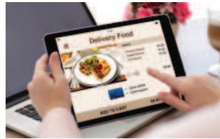
Food Delivery Service

App based service connecting users to commuter buses to find more convenient rides to work