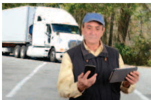
On Demand Trucking Service

App connecting truck owner operators with available jobs