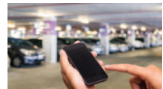
Car Parking/Watching Service

App based service delivering bags for major airlines and goods from a home improvement supplier to construction sites