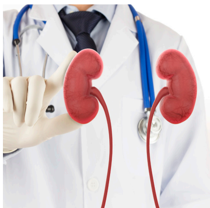
UROLOGY SURGEON OHIO

Primary Professional Liability 1M/3M - 2nd year claims-made Past Claims