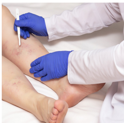
VASCULAR SURGEON CONNECTICUT

Primary Professional Liability 1M/3M - RDI claims-made Past Claim