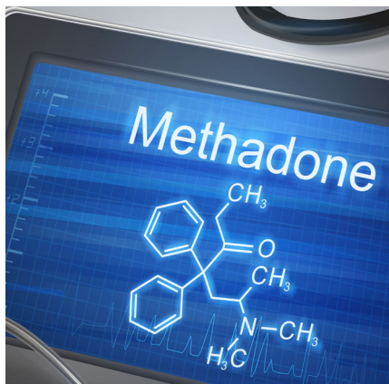
ADDICTION/METHADONE CLINIC VIRGINIA

Primary Professional Liability 1M/3M – RDI claims-made Encounters: 4,200; Revenue: $1.2M