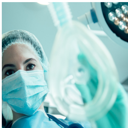
ANESTHESIA STAFFING SERVICES MULTI-STATE

Primary Professional Liability 1M/3M – RDI claims-made Encounters: 4,200; Revenue: $1.2M