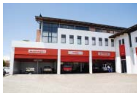
Auto Repair Shops