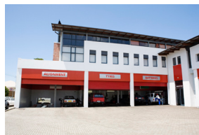
Auto Repair Shops